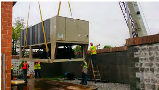
Daikin Chiller Replacement Project Quantico VA